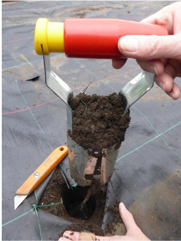
Lift out with soil